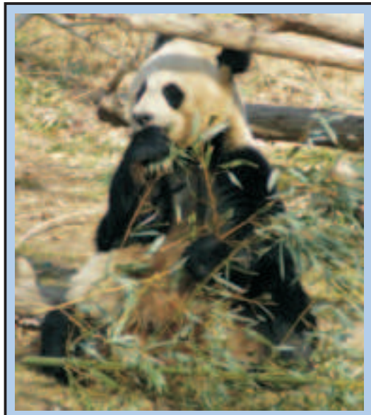
The Giant Panda

Some evolutionists have rather arrogantly claimed that this special thumb is a poor design and that a Creator would never have made it that way. However, they can't explain how it could have evolved (the fossils show that although pandas were smaller in the past, there has been no evolution). The panda's extra thumb does an excellent job, and is a tool that bears all the marks of design by an intelligent Creator.