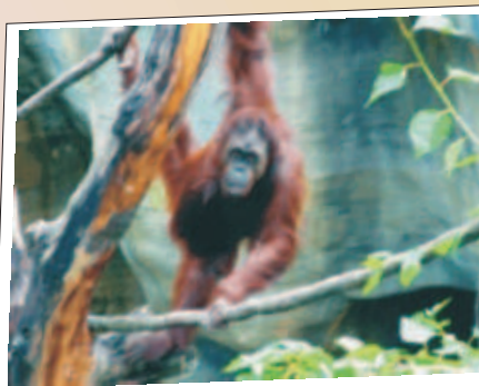
An orangutan in the trees

Actually, this study only proves one thing: that orang-utans often walk upright in the trees! It tells us nothing whatever about human origins, but is based on the assumption of evolution, and that a common ancestor existed, even though no trace of such a creature has ever been found.