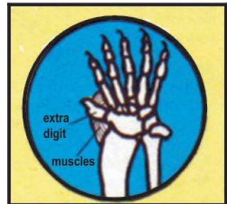
The panda's extra 'thumb'

These attractive black-and-white mammals live only in eastern Tibet and southwest China. There have been concerns that they may become extinct because many of the bamboo forests they depend on for food have been cut down. There has been some success with breeding pandas in captivity, but they are still an endangered species.