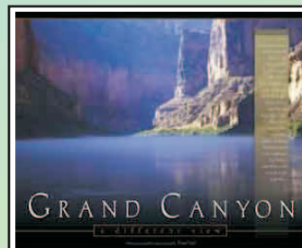
The book they tried to ban because it presented a different view of the Grand Canyon's formation.