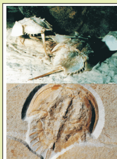
The living horseshoe crab (top) is just the same as the fossil (below), which is claimed to be '500 million' years old.

Evolution is supposed to be a process of ongoing change. Darwin wrote, "We may safely infer that not one living species will transmit its unaltered likeness to a distant futurity." So it may come as a surprise to most people that thousands of living organisms have not changed at all, but are just like fossils which evolutionists claim are many millions of years old.