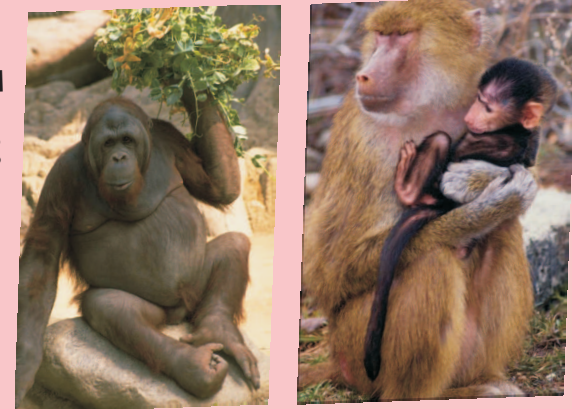
Cute — but no relation to us!

WE are often told in magazines and TV programmes that apes and monkeys are our close relatives — they are often called our "cousins." This is because many people believe in evolution — the idea that all living things, including ourselves, have evolved from "simpler" ancestors. Life is supposed to have started in the sea, but over millions of years fish grew legs and became amphibians, amphibians became reptiles, and reptiles evolved into birds and mammals. Eventually an ape-like creature appeared which was the ancestor of apes, monkeys and humans. This creature is sometimes called "the missing link" because no fossils have ever been found to prove it existed! We are similar to apes and monkeys in some ways, because we're created to live in the same world, but there is no real evidence that we are related to them.