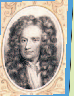
Sir Isaac Newton

Sir Isaac Newton, (1643–1727) has been described as “the most famous scientist who ever lived.” He did research on the Law of Gravity, and the movement of the planets. He described the solar system as “This most beautiful system of the sun, planets and comets”, and said it must have been created by “an intelligent and powerful Being.” Newton believed the Bible was completely true and dependable, and that God created the world in six days just as the Bible says.