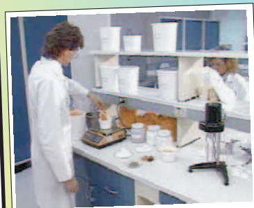
Real science is based on what we can see. No one has ever seen evolution happening.

However, there are many other scientists who have decided they want to explain the world without God, and insist that life came through evolution. But they have to ignore all the facts which support belief in creation, and have never seen evolution happening. Creation scientists believe that God helps them in their work, and more and more discoveries are being made which show that the Bible is true. But the greatest discovery these scientists have made is that God the Creator loves them, and sent His Son Jesus to earth to prove that love by dying on the cross. “Christ died for us while we were still sinners. In this way God shows his great love for us.” ( The Bible, Romans 5: 8 ). You may grow up to be a scientist and discover more evidence that God created everything. But don’t miss the greatest discovery of all — that God loves you!