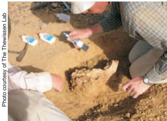
Uncovering a manatee fossil in India. There is no evidence they evolved from land animals.

Manatees are perfectly designed for their way of life. We believe God made them that way in the beginning when “He created every living thing that moves in the sea.” (Genesis 1: 21).