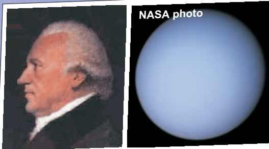
William Herschel, and the planet Uranus